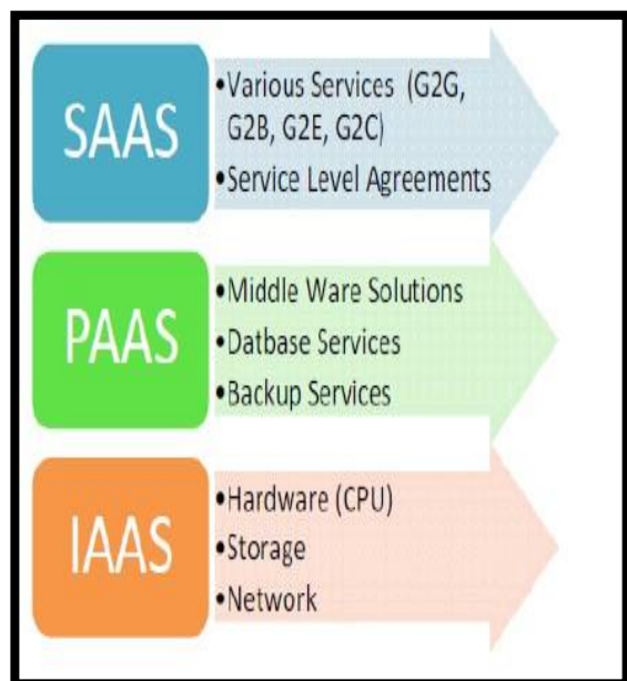
Fig 4: Layers of Cloud Computing

The cloud computing is comprised of three major layers SaaS pass and IaaS: