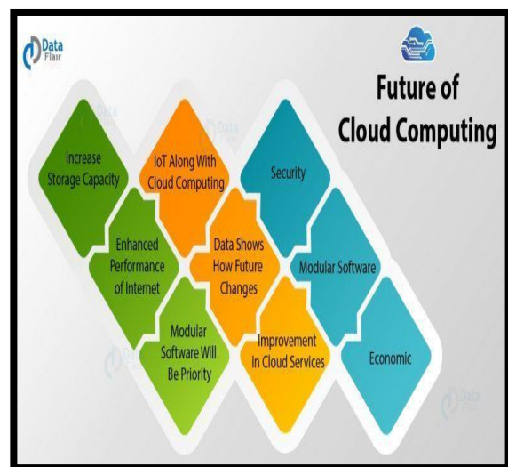
Fig 6: Future of cloud computing

If cloud computing will continue to evolve the use of hardware will be less as most of the work will be done with the help of cloud computing and virtualization. We can save the setup cost of software by dividing it and this will lead to decreasing the use of hardware. If the evolution continues the data stored in the cloud will get analysed with the help of a machine and it won't require any human help.