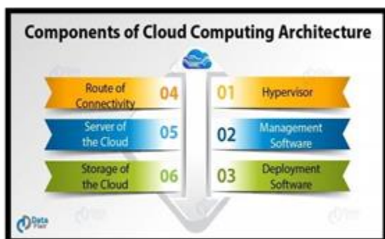
Fig 2: Components of cloud computing

Customers interact to manage their information in the cloud.