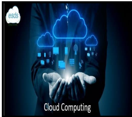
Fig 1: Cloud Computing

hardware (such as hardware as a service or HaaS), or infrastructure (infrastructure as a service, IAAS).