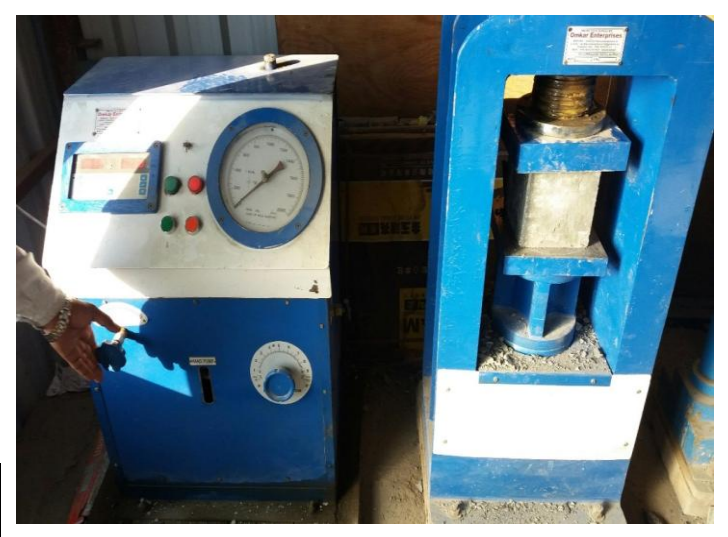
Fig. 2 Testing of Cubes