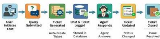
Fig. 1. Workflow of Online Chat Box with Ticketing System