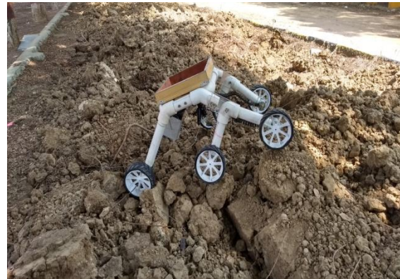
Fig: 3- Vehicle climbing unequal surfaces.