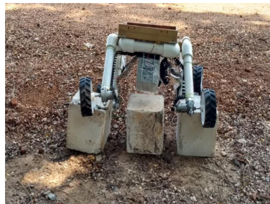
Fig:4- Vehicle climbing rocks.