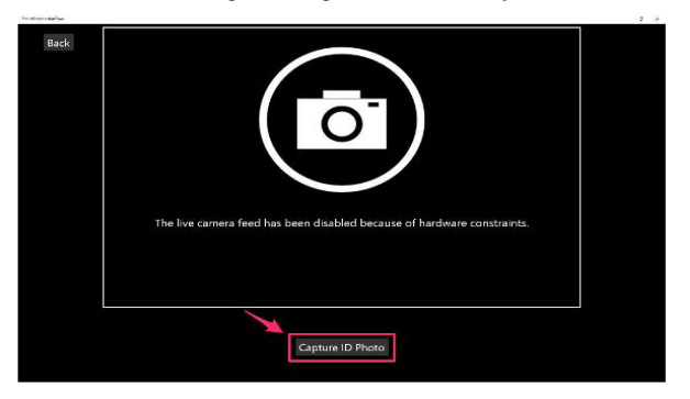
Fig.4 Adding User Functionality

Database is maintained for registered users on the cloud support and temporary database storage for guest users.