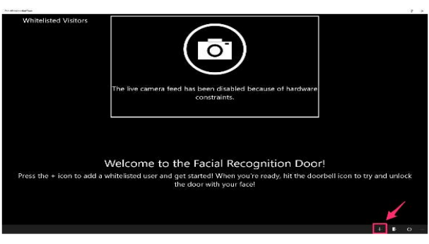
Fig.3 Adding User Functionality