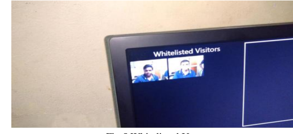
Fig.5 Whitelisted Users

Database is maintained for registered users on the cloud support and temporary database storage for guest users.